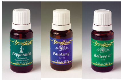
Three essential oils frequently used for easing muscle and joint pain.

While not everyone will experience such dramatic results, these testimonials are intended to give hope,