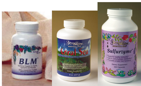
Trio of YL supplements that may ease joint and muscle pain.

Because MSM is not absorbed well unless it is taken with high levels of Vitamin C, amino acids and protein, Sulfurzyme includes Chinese wolf-berries which contain all three!